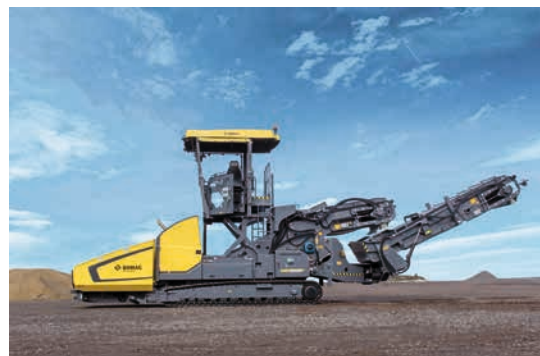
Everything in view – the lift platform offers the best overview.