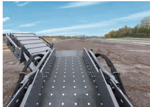
Flexible in use – the optionally available swivel belt with 6.5 m (OC 650) for BMF 2500 S.